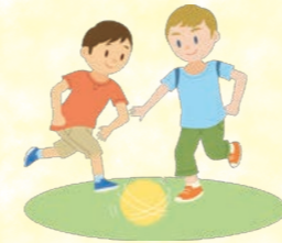
Exchange through sports