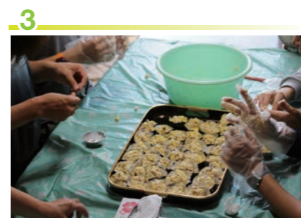
3 Cooking using the harvested vegetables