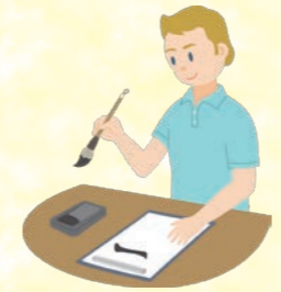
Japanese cultural experiences such as calligraphy