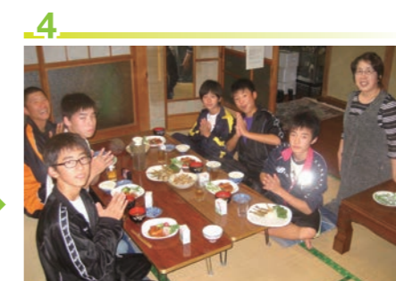
4 Dinner and a bath (Note: Participants will bathe in the home's bathtub or in a local hot spring facility.)