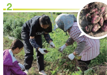
2 Picking vegetables and fishing Harvesting edible wild plants, etc.