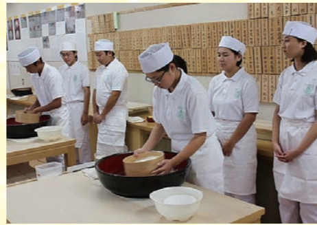
▲ The soba making team at Takada High School. It competes in nationwide competitions for high school students.