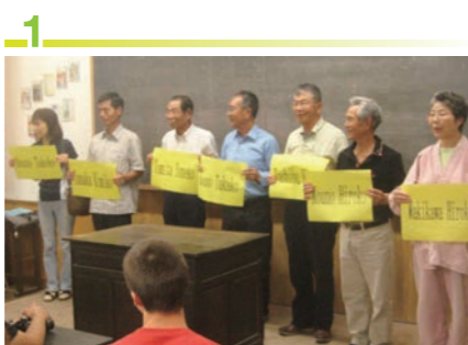
1 Welcome ceremony Traveling in the host family's car