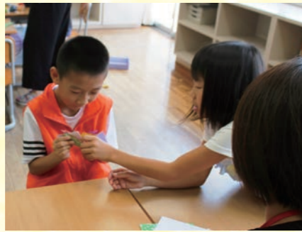
▲ Experiencing Japanese play such as origami and kendama at Kakaji Elementary School.